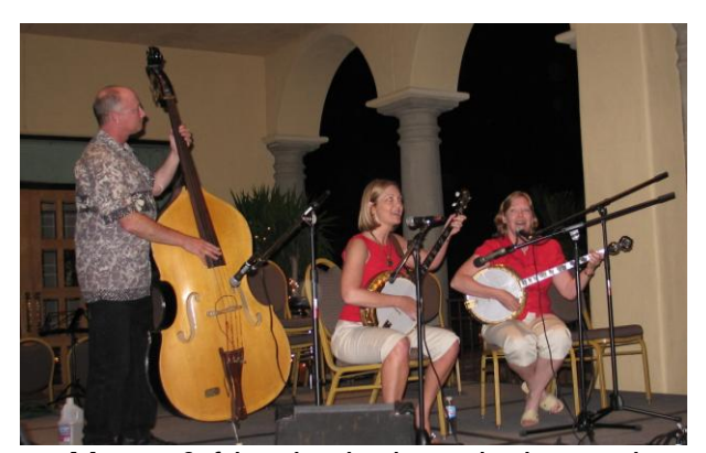
Marge & friends singing, playing and promoting their new CD in Tucson.

FOR SALE: JET 14 #1034 Fiberglass hull, DM2 mast, North sails & additional set, spinnaker with accessories, custom canvas cover, storage trailer $1,900