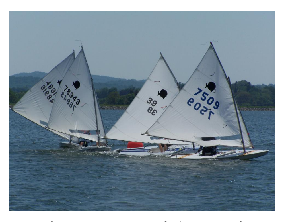
The Top Four Sailors in the Memorial Day Sunfish Regatta – See pp. 3 & 5

To receive Foc's'le in color by email (and save HSC some $) send note to <a href="mailto:force5@verizon.net">force5@verizon.net</a> with "Foc's'le by email" in the subject line