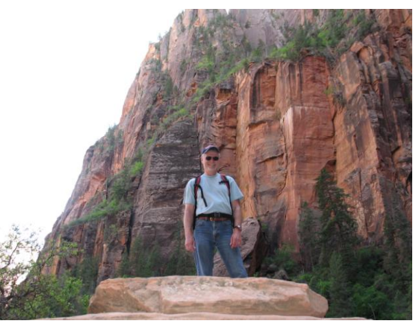
Editor in Zion NP